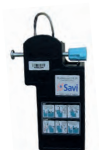
SEAL LOCK MASTER (SLM)